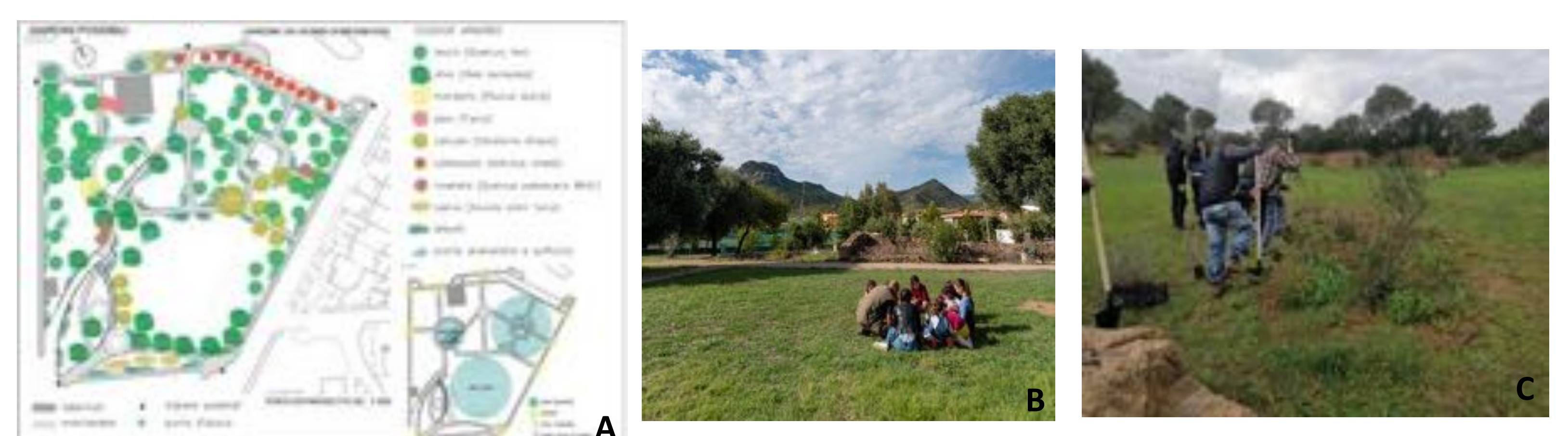
Fig 4. A: Garden plan; B & C: Children and adults engaged in creating the garden

The project is currently in the executive phase and will be delivered in early 2024