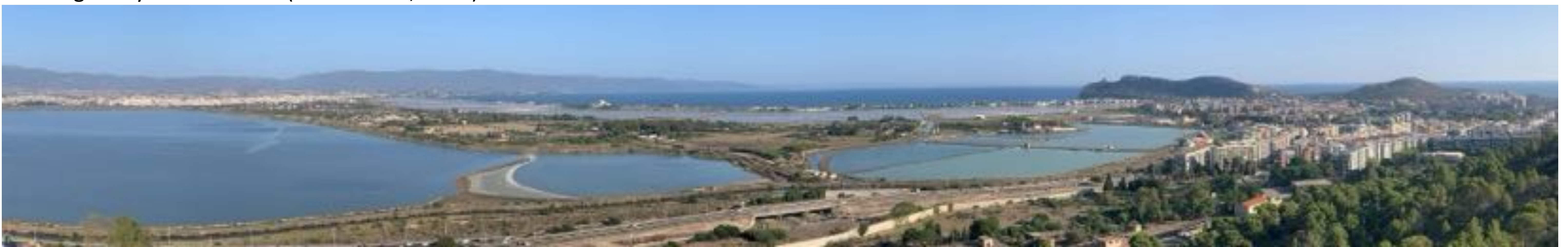
Fig 1. Panoramic view of the metropolitan city of Cagliari and the Molentargius wetlands

Urban forestry originated in the 19th century with the aim of making overcrowded cities healthier. United Nations demographic projections predict that in 2050, two-thirds of the human population will live in cities (Ritchie & Roses, 2018). This process entails challenges on the environmental and social sustainability of cities. The ecosystem services generated by urban forests represent the solution for mitigating the main problems linked to urban environments (Ferrini et al., 2017). The conscious choice of a floristic composition dominated by native species is precisely what can ensure greater biodiversity and greater resilience over time, permanently guaranteeing ecosystem services (Almas et al., 2016).