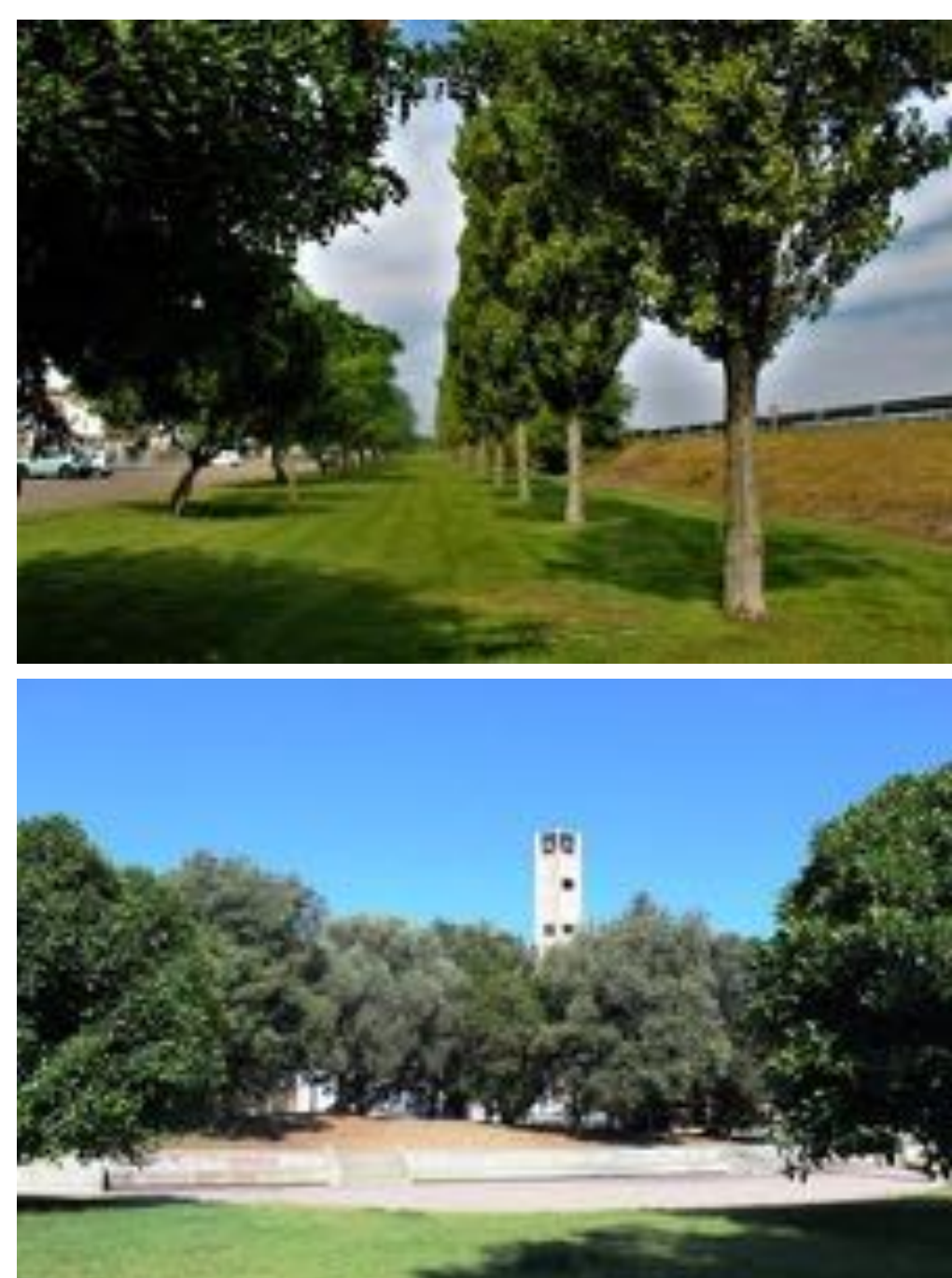
Fig 3, Assemini town green areas views.