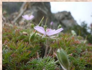
Erodium foetidum ssp foetidum