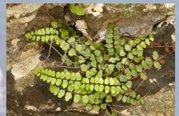
Asplenium trichomanes ssp inexpectans